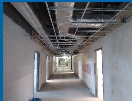
Install ceiling grid in 2010A corridor