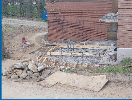
Form and Pour Generator Pad