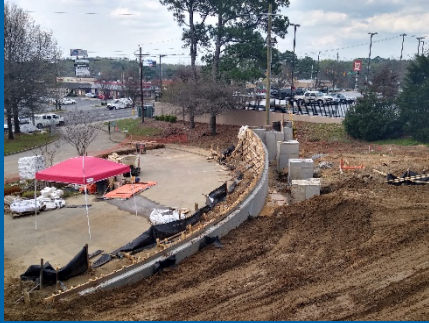
Relocate Power Pole and Begin Backfill at ADA Ramp