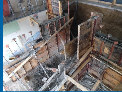
Form and Pour Entry Walls